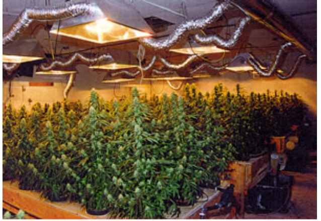
The controlled environment permits year-round cannabis cultivation.

During the past two decades, marijuana potency has increased. According to the University of Mississippi's 2000 Marijuana Potency Monitoring Project (MPMP), commercial-grade marijuana THC levels rose from under 2 percent