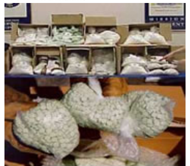
Operation Red Tide began as a result of the largest single seizure of Ecstasy (MDMA). Over 1,000 pounds (2.1 million tablets) were seized on July 2, 2000, in Los Angeles, CA.

Another emerging trend is the use of Mexico as a transit zone for MDMA entering the United States. During 2000, several seizures were reported in or destined for Mexico. In September 2000, Dutch authorities seized a 1.25 million-tablet shipment of MDMA destined for Mexico. Previously, in April 2000, a shipment of 200,000 MDMA tablets was seized at the airport in Mexico City.