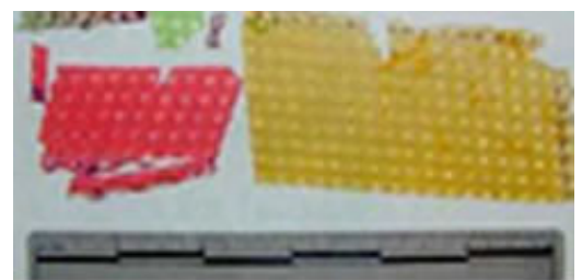
LSD gelatin tablets or "window panes" liquid. To a lesser extent, LSD is sold as a

Lysergic acid diethylamide (LSD) remains available in retail quantities in virtually every state. LSD production reportedly is centered on the West Coast, particularly in San Francisco, northern California, the Pacific Northwest, and recently the Midwest. Since the 1960s, LSD has been manufactured illegally within the United States. LSD production is a time-consuming and complex procedure. Several chemical recipes for synthesizing LSD are on the Internet, but clandestine production requires a high degree of chemical expertise. Chemists maintain tight control at the production level, but do not necessarily participate in the distribution of the drug. These chemists usually sell the crystal LSD product to one or two trusted associates, insulating themselves from the wholesale distributors.