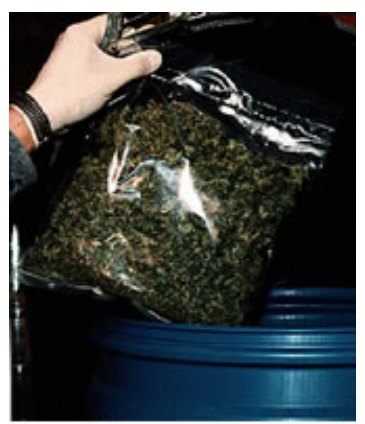
Marijuana packaged for sale

Organized crime groups operating from Mexico conceal marijuana in an array of vehicles, including commercial vehicles, private automobiles, pickup trucks, vans, mobile homes, and horse trailers, driven through border ports of entry. Larger shipments ranging up to multithousand kilograms are usually smuggled in tractor-trailers, such as the 6.9 metric tons of marijuana seized on April 3, 2001, by USCS officials from a tractor-trailer at the Otay Mesa, California, port of entry. The marijuana packages had been wrapped in cellophane, coated with mustard, grease, and motor oil, and commingled in a load of television sets.