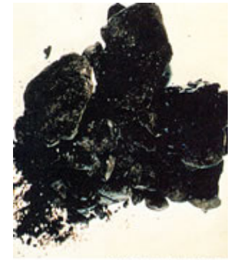
Mexican black tar

Although illegal immigrants and migrant workers frequently smuggle heroin across the U.S./Mexico border in 1- to 3- kilogram amounts for the major trafficking groups, seizures indicate that larger loads are being moved across the border, primarily in privately owned vehicles. Once the heroin reaches the United States, traffickers rely upon well-entrenched polydrug smuggling and distribution networks to deliver their product to the market, principally in the metropolitan areas of the midwestern, southwestern, and western United States with sizable Mexican immigrant populations.