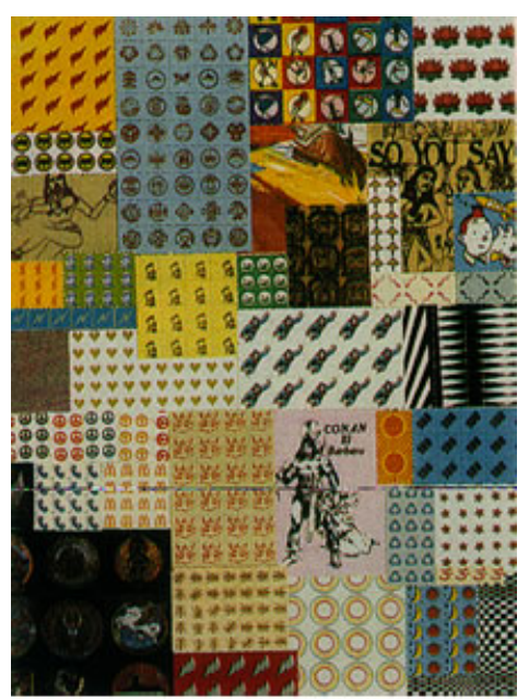
Examples of LSD blotter paper

Few LSD laboratories have ever been seized in the United States because of infrequent and irregular production cycles. In 2000, DEA seized one LSD laboratory that was located in a converted missile silo in Kansas. LSD is produced in crystal form that is converted to liquid and distributed primarily in the form of squares of blotter paper saturated with the