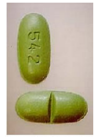
New Rohypnol tablets include a dye that make the drug visible if slipped into a drink

Flunitrazepam is sold under the trade name Rohypnol, from which the street name "Rophy" is derived. Other street names include "circles," "Mexican valium," "roofies," and "R-2." Flunitrazepam is a depressant used in the treatment of short-term insomnia and as a hypnotic sedative and pre-anesthetic medication.