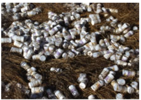
Discarded pseudoephredrine bottles

Because of law enforcement attention and strong state precursor control laws in California, traffickers have now diversified to pseudoephedrine suppliers nationwide, buying at relatively lower prices in other parts of the country and trafficking the product to California, where the black market price can bring up to $5,000 per pound of product.